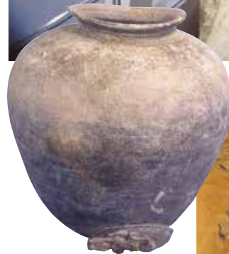
Urn of Sue Ware Excavated from Kiln No.53