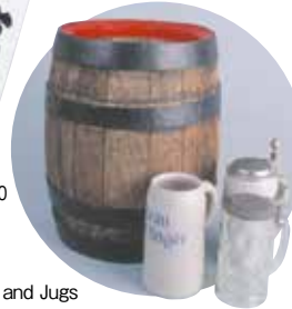
Beer Barrel and Jugs