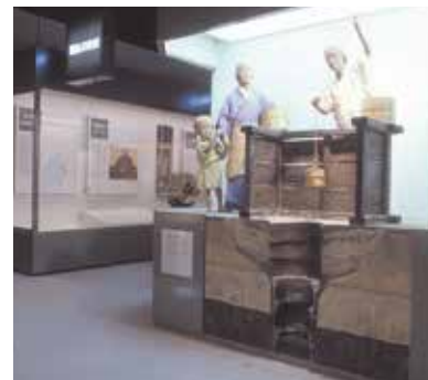
Reconstructed Well of Kurodo Site