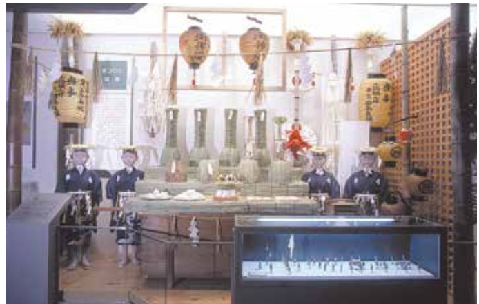
Materials for Donji Festival