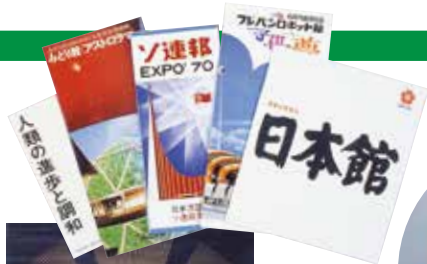
Brochures of Japan World Exposition '70