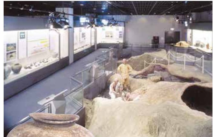
Exhibition Room 2