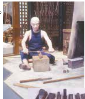
Model of Workshop of Blacksmith