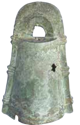
Replica of Bronze Bell from Yamada