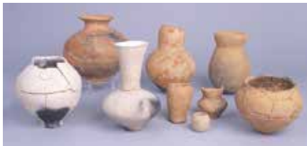
Yayoi Earthenware from Tarumi Site