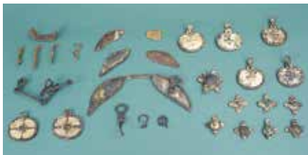
Harness from Ancient Tomb of Shin-Ashiya