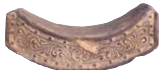
Roofing Tile from Kishibe Kiln Site