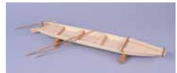
Miniature of Kasho Vessel