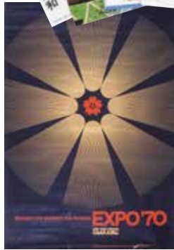
Poster of Japan World Exposition '70