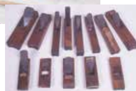
Planes Made by Hard-Wood Artisans