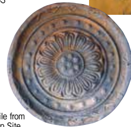
Roofing Tile from Nanao Kiln Site