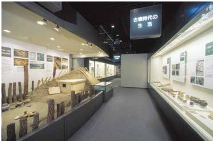
Exhibition Room 1