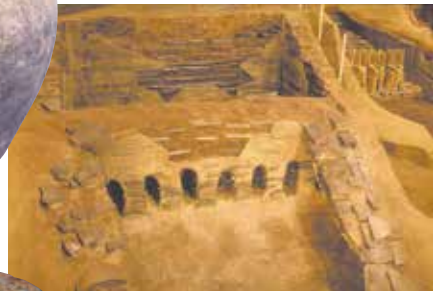
Kishibe Kiln Site H No.1